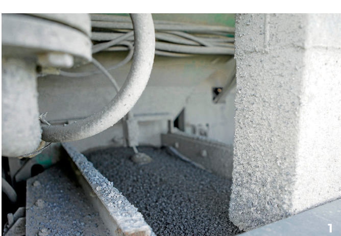
1 computer-controlled supply of aggregates via belt weigher depending on requirements | 2 taking retained samples for quality assurance | 3 high daily output thanks to modern DSK-AIR paving equipment